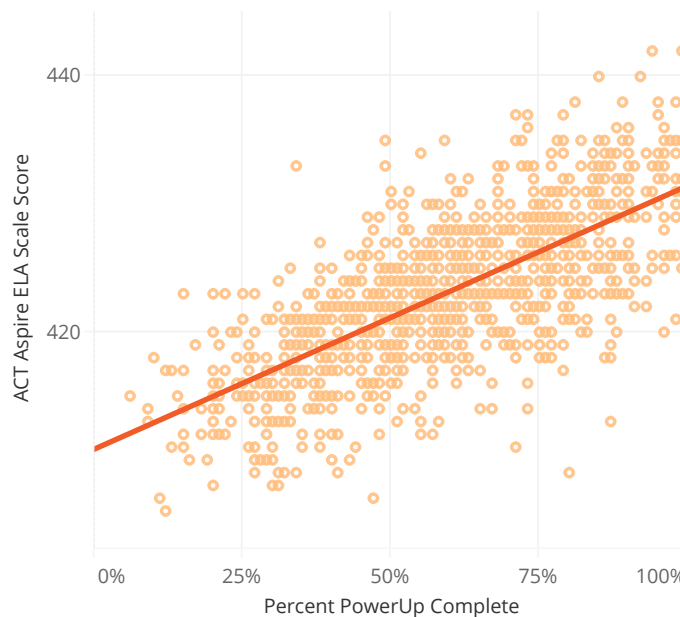
Correlation between Percent PowerUp Complete and ACT Aspire ELA Scale Scores

The correlation between percent of PowerUp complete and ACT Aspire ELA scale scores is